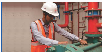
Comprehensive AMC Options