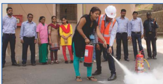
Fire Drills & Training