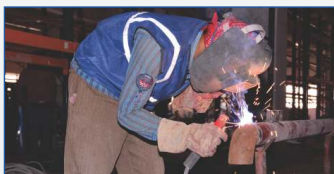
Sale & Installation of all fire equipment