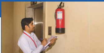
Fire Safety Audit