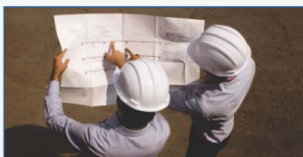
Study & Design of new system